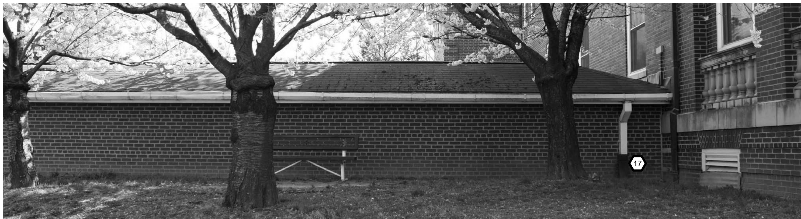
3 CC 57-139 - Inside Loop N.T.S.