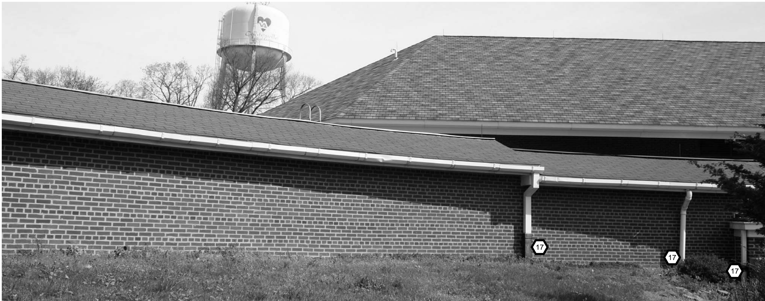
5 CC 58-139 - Partial Inside Loop 1 N.T.S.