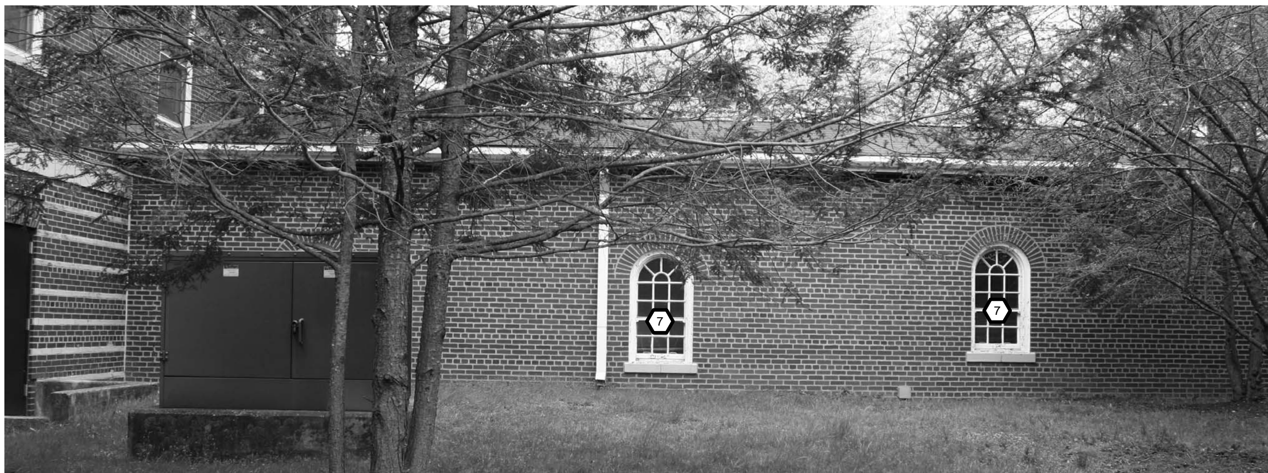
1 CC 57-139 - Partial Outside Loop1 N.T.S.