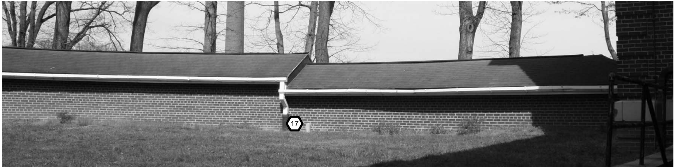
8 CC 58-59 - Partial Inside Loop N.T.S.