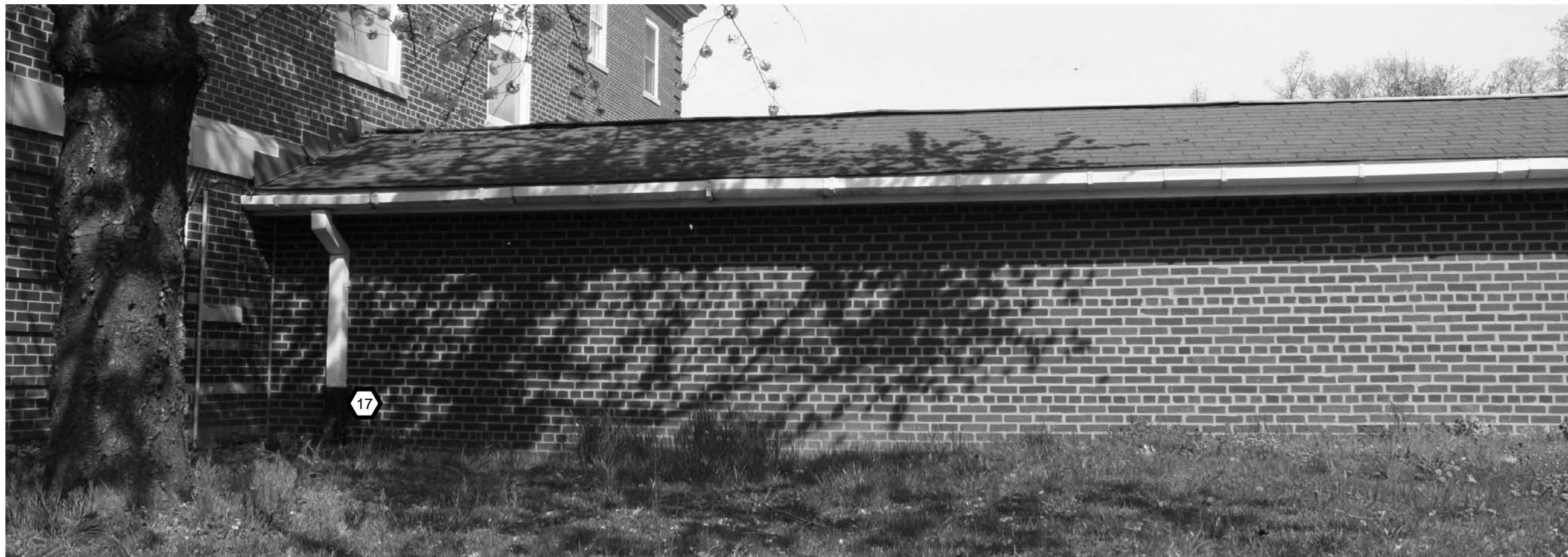
4 CC 58-139 - Partial Inside Loop N.T.S.