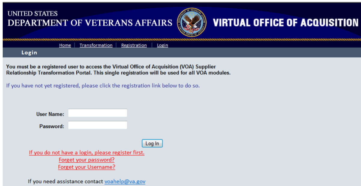
Figure 5: Login page