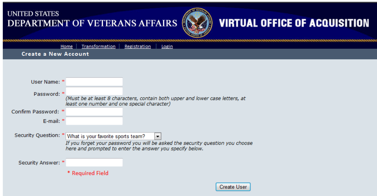
Figure 2: Create a New Account