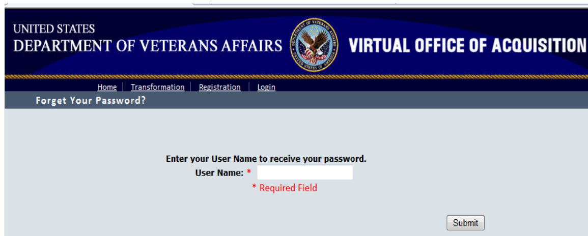
Figure 6: Forgot Password