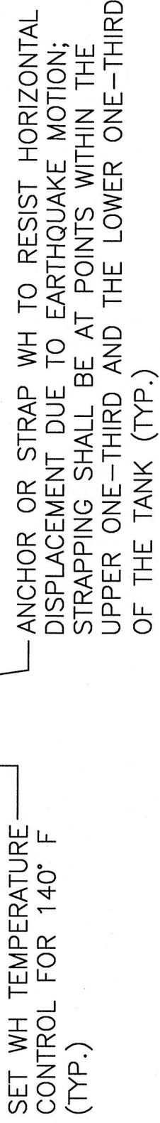
3 WATER PL401 SCALE: NONE