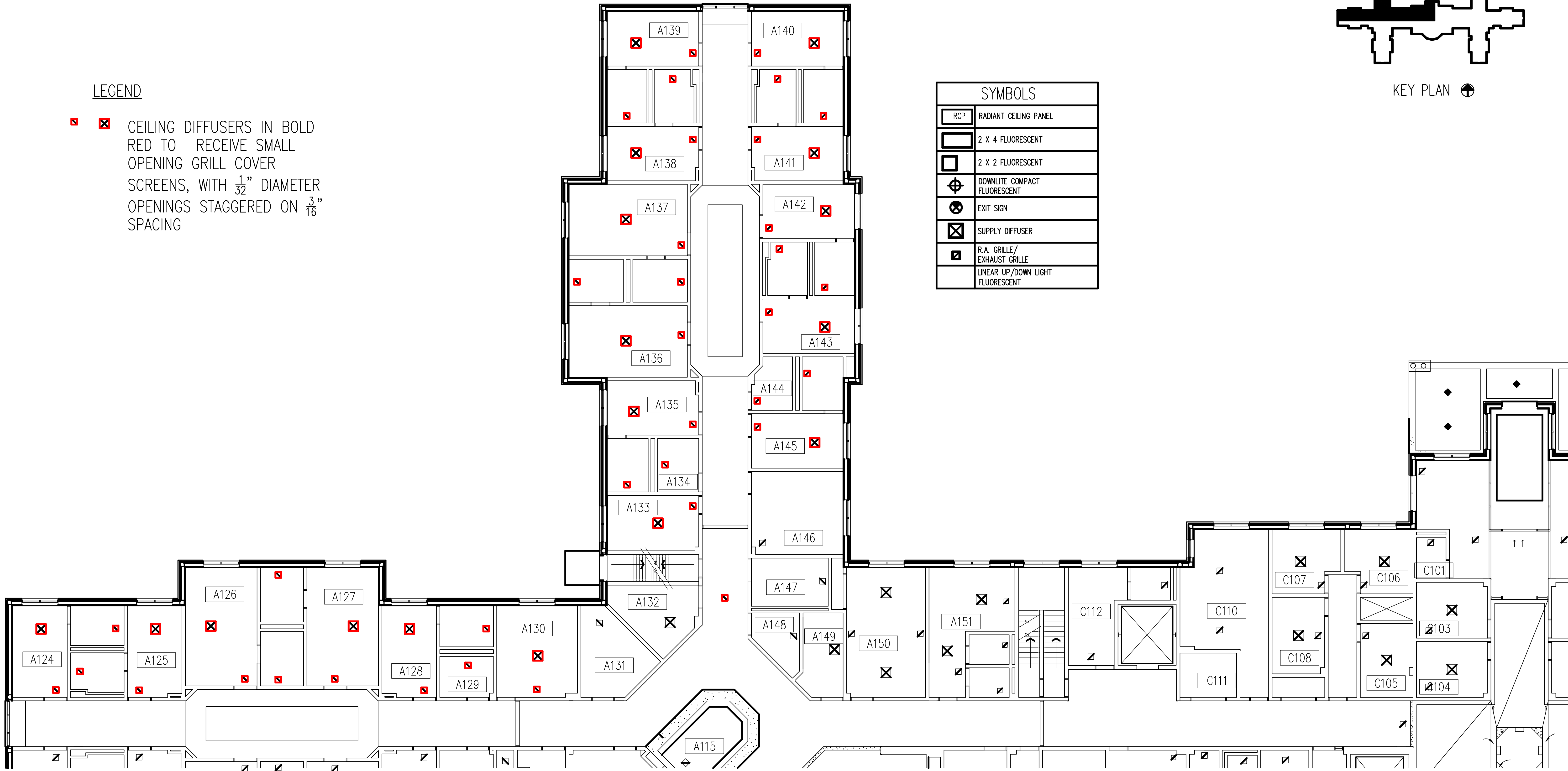
PARTIAL REFLECTED CEILING PLAN - A SCALE: 1/8"=1'-0"