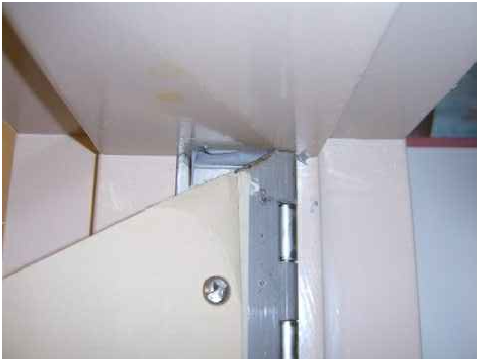
LEFT AND ABOVE IMAGES: EXISTING BATHROOM DOOR HINGES (TYPICAL OF PERRY POINT AND BALTIMORE VAMC)