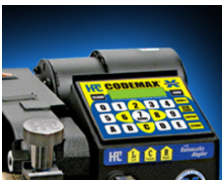
The original computerized code machine, contains depth & space data for more than 950 lock types