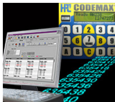
Download bittings from CodeSource® and MasterKing® for error-free key-cutting

CodeMax® is the Original Computerized Code Machine . Based on the "Standard of the Industry" Blitz™, CodeMax® has an internal computer chip that contains Depth & Space Data (DSD) for more than 900 different lock types . This machine can accommodate keys with up to 14 spaces and 14 depths ; it also has a micrometer function in both inch and metric formats. This versatility allows it to cut virtually all standard vehicle, commercial, residential and furniture keys throughout the world. It includes 5 cutters (No. CW-14MC, No. CW-1011, No. CW-47MC, No. CW-90MC and No. CW-20FM)