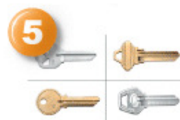
Key Blank Cross-Reference