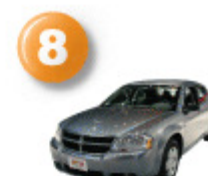
Car Opening Information