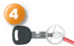
Search By Bitting