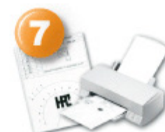
Print Code Cards