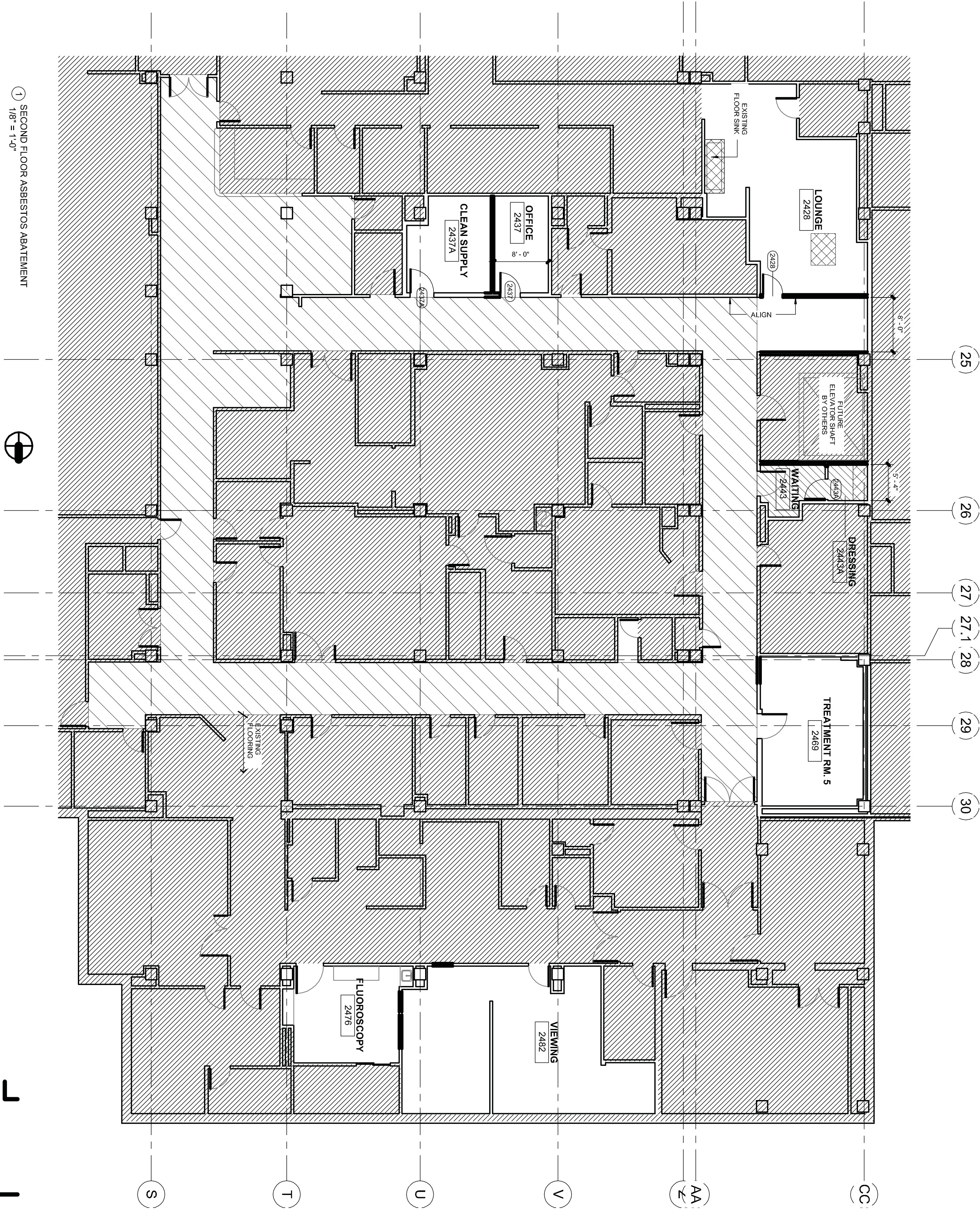
① SECOND FLOOR ASBESTOS ABATEMENT 1/8" = 1'-0"