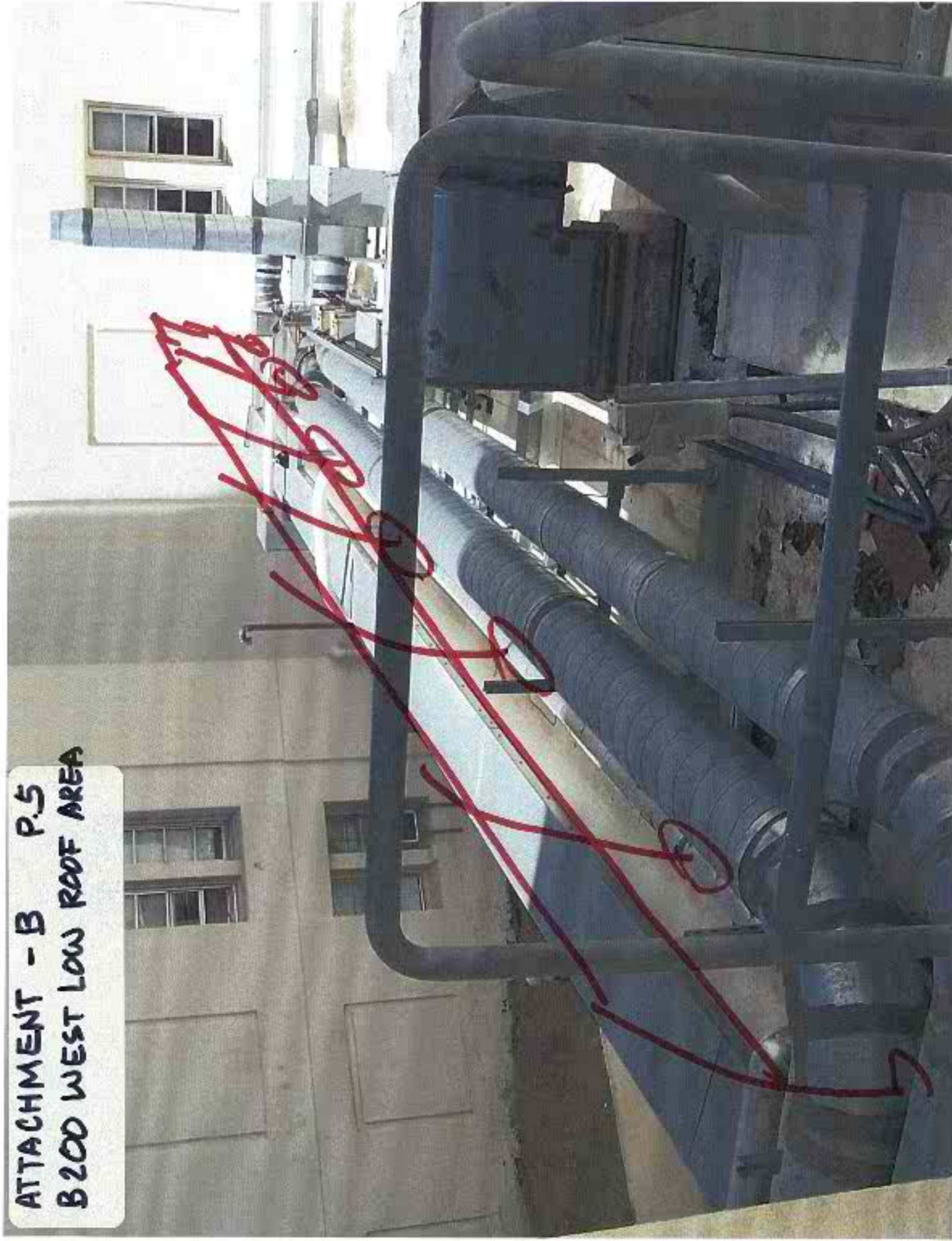
ATTACHMENT - B P.5 B200 WEST LOW ROOF AREA