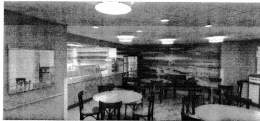
ARTIST'S RENDERED PERSPECTIVE - DINING AREA