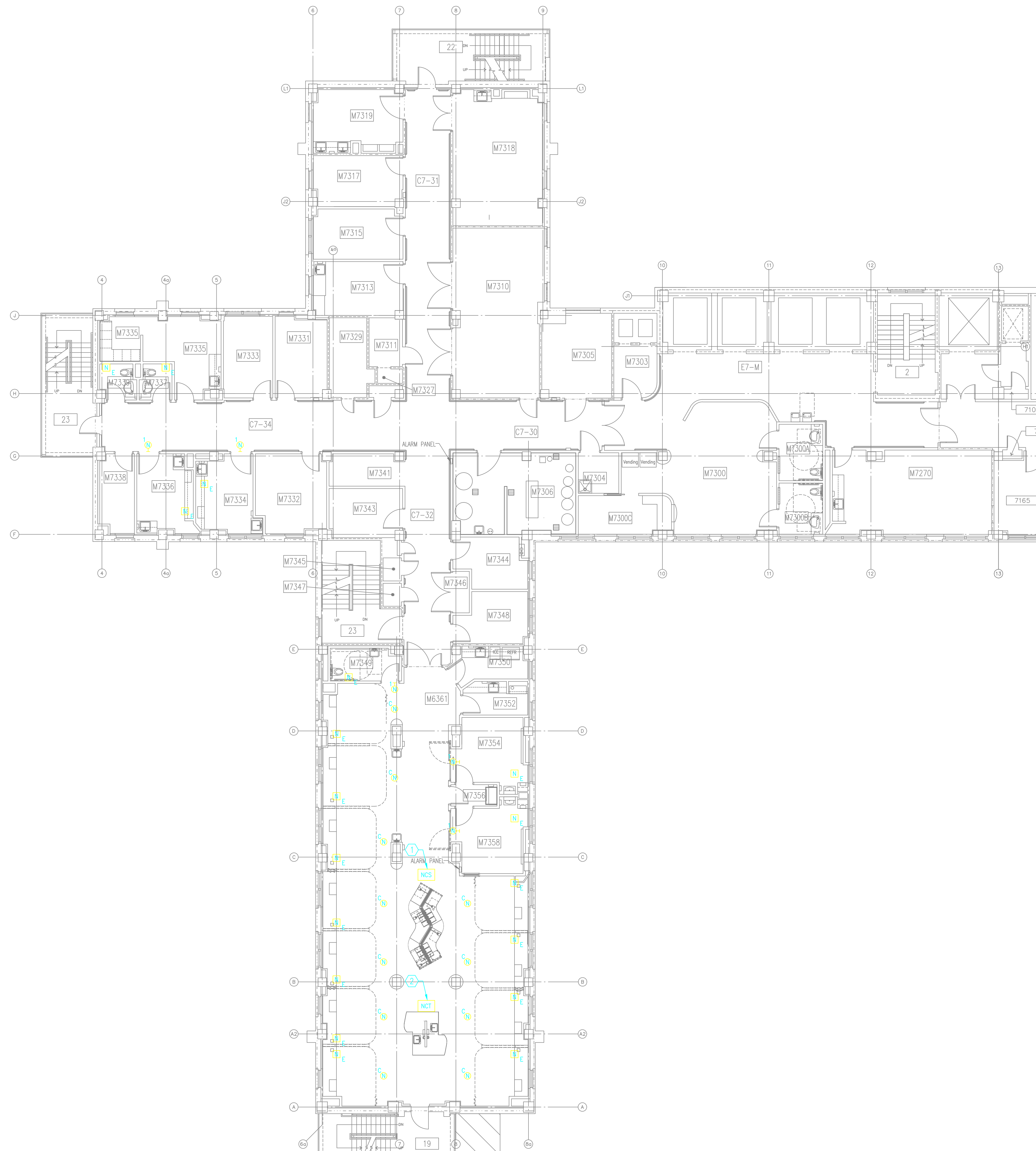
1 PARTIAL SEVENTH FLOOR PLAN SCALE: 1/8"=1'-0" NORTH