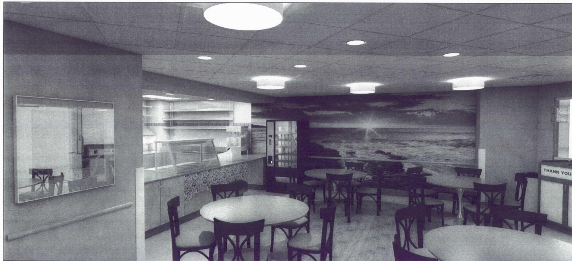
ARTIST'S RENDERED PERSPECTIVE - DINING AREA SCALE: NONE