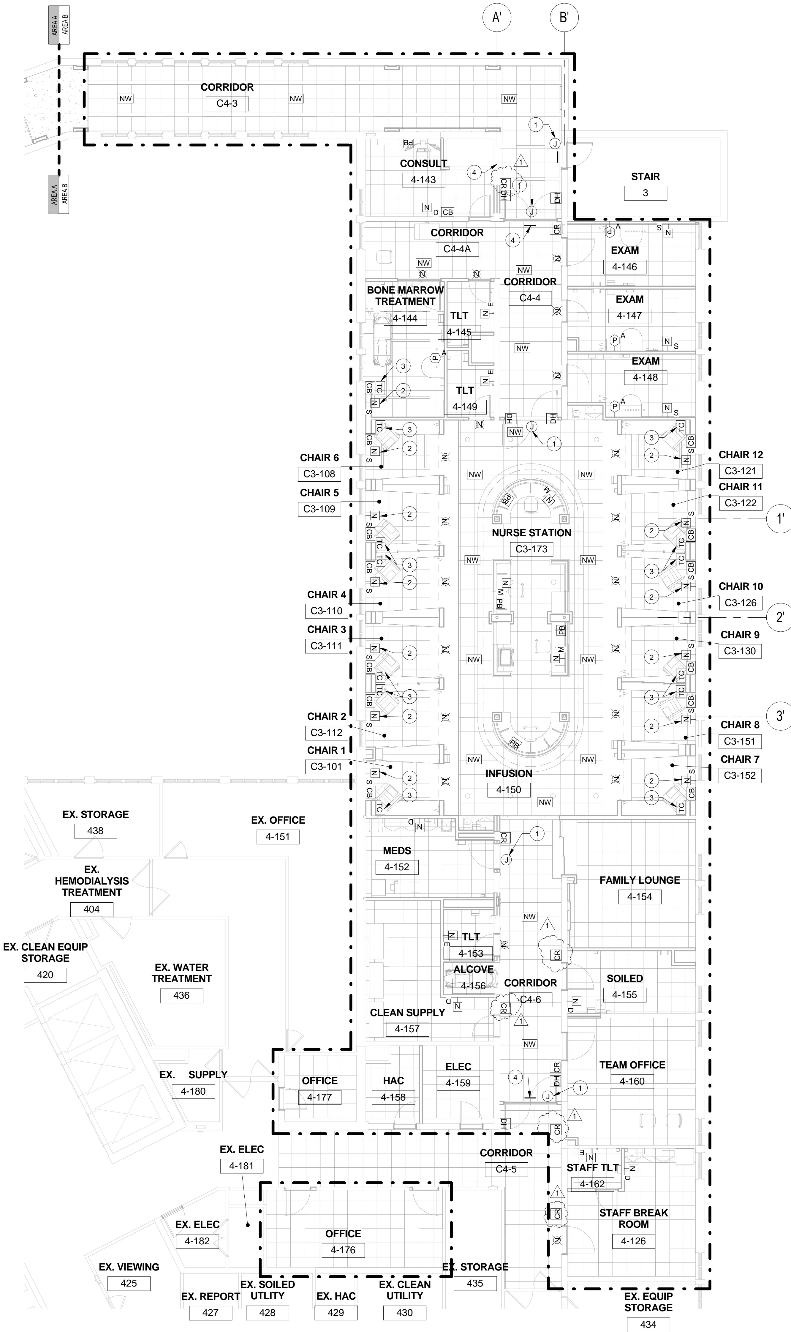
2 PARTIAL 4TH FLOOR ELECTRICAL SYSTEMS PLAN AREA B 1/8" = 1'-0"