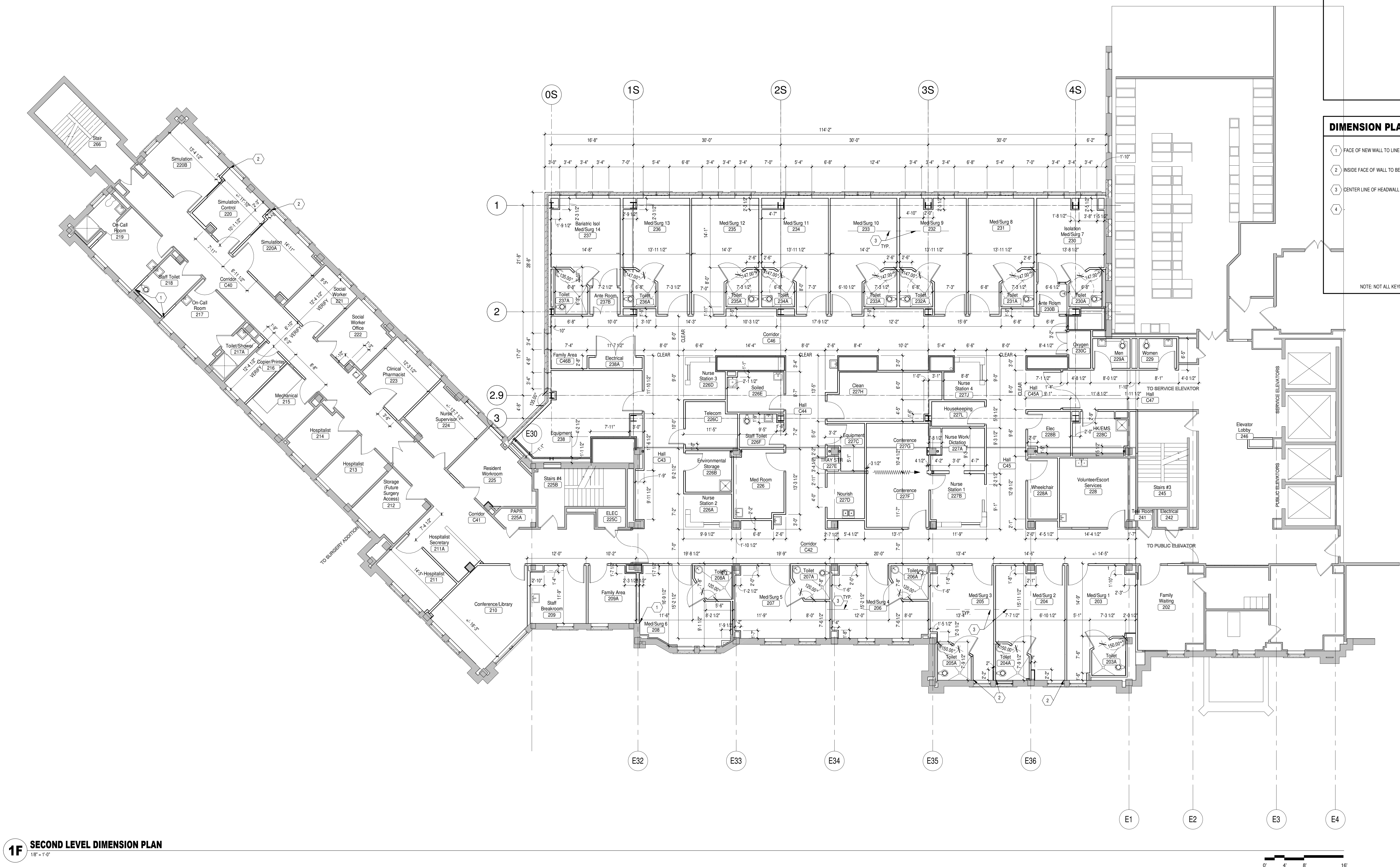
1F SECOND LEVEL DIMENSION PLAN 1/8" = 1'-0"

NOTE: NOT ALL KEYNOTES MAY BE USED ON EACH PLAN