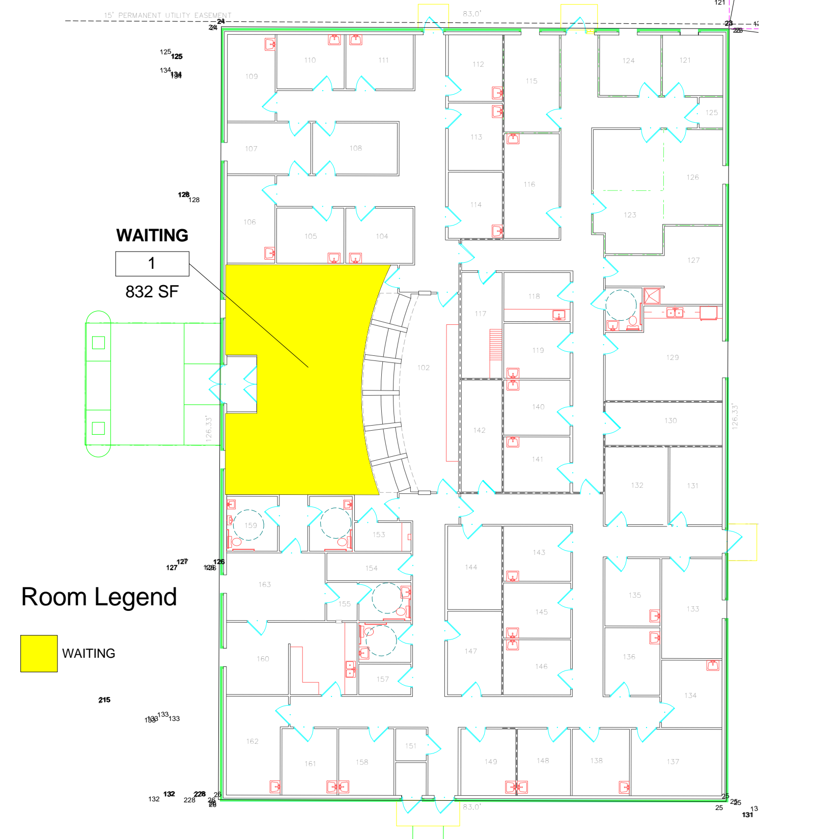
1 L1 FLOOR PLAN - COVERAGE AREA 1/16" = 1'-0"