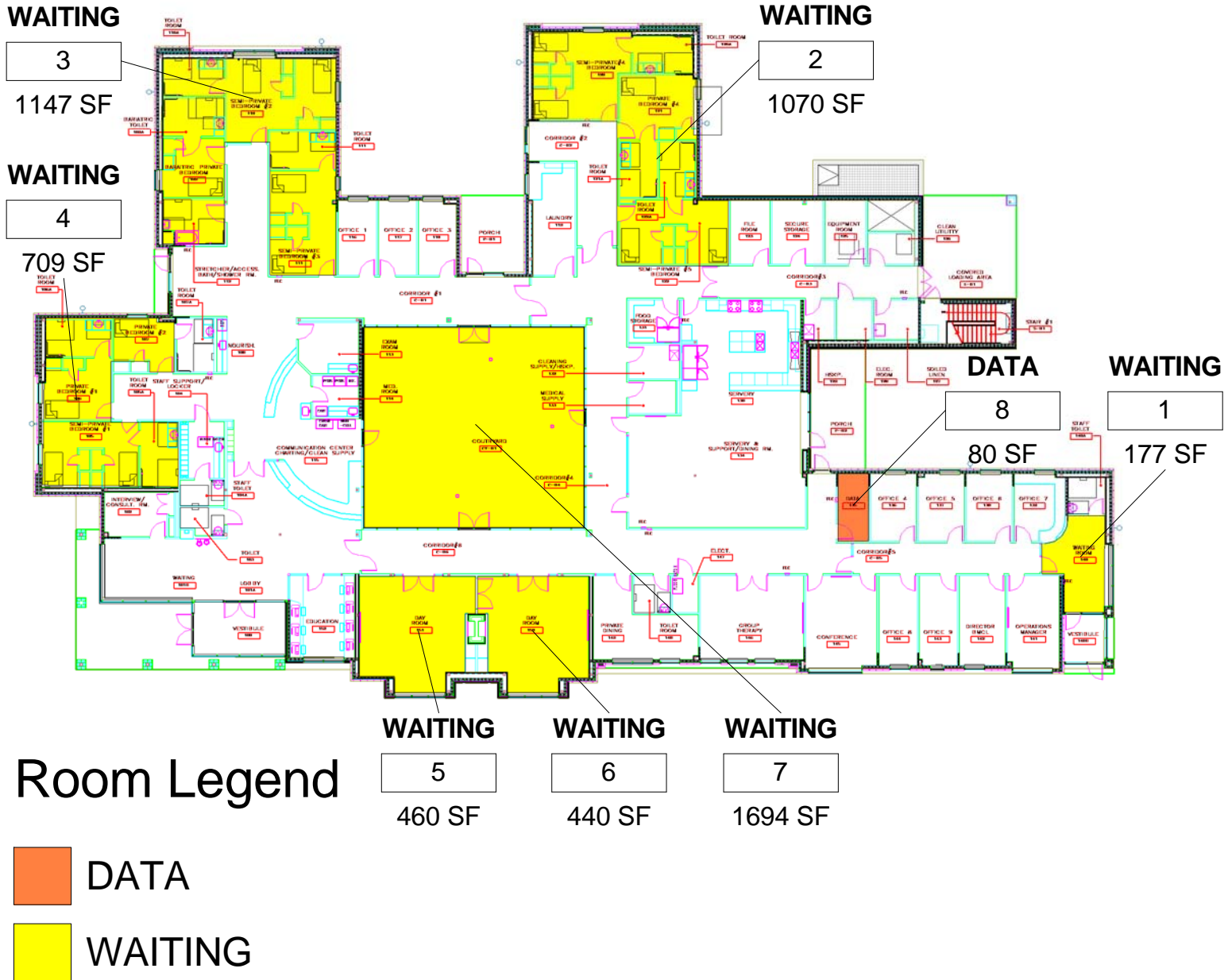
1 L1 FLOOR PLAN - COVERAGE AREA 1" = 30'-0"