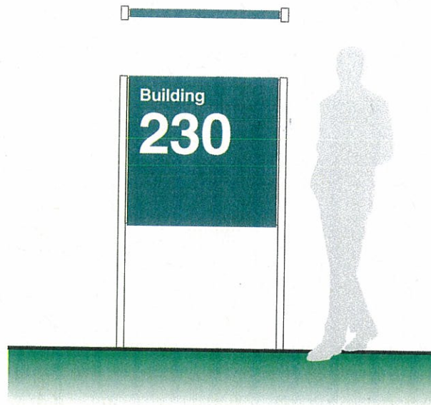
Message Layout A

Position sign so drivers have a clear, unobstructed view of the sign.